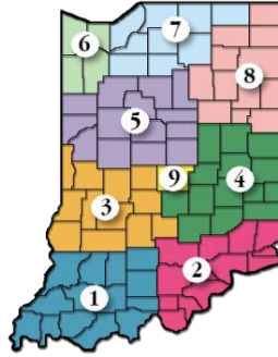
Table 1: Participating INTESOL Collaborative Members by Region, November 11, 2016